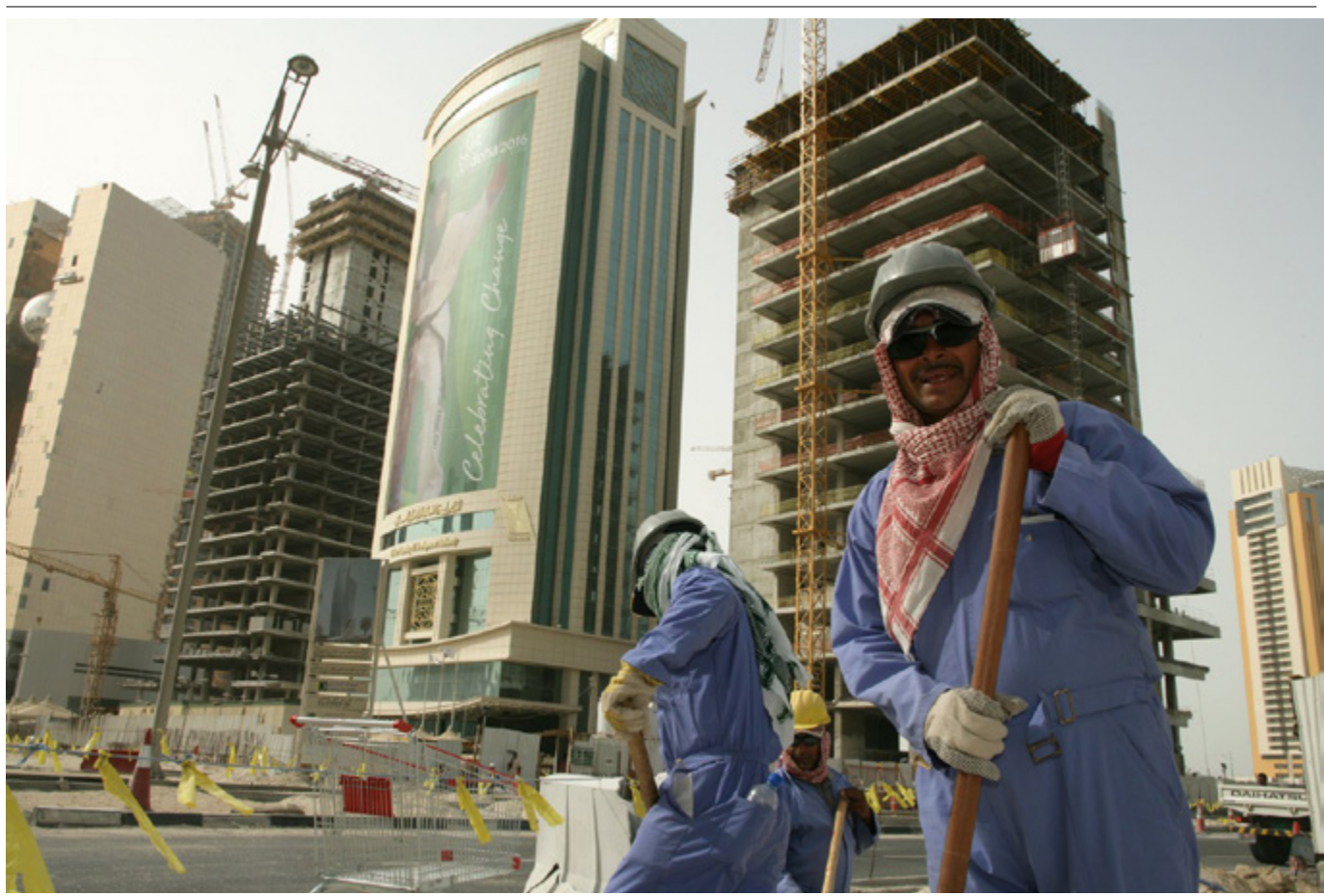
Construction workers in Doha, Qata

following a consultation on the issue. LAPFF responded to the consultation highlighting the importance of social factors in our work and outlining some of the engagements that the Forum has undertaken on social issues for over three decades. The taskforce is comprised of people from the industry and, alongside the DWP, includes observers from the Financial Conduct Authority, Financial Reporting Council, HM Treasury and the Pensions Regulator.